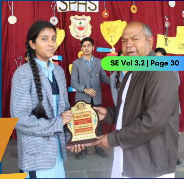
SE Vol 3.2 | Page 30