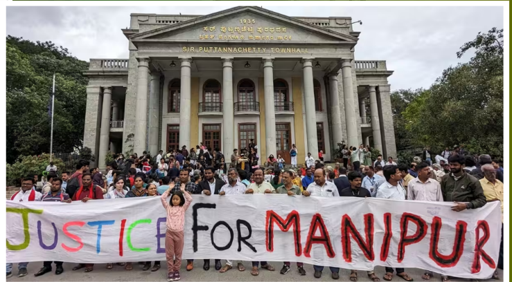
People gather outside Town Hall in Bengaluru to protest the alleged sexual assault of two tribal women in Manipur.