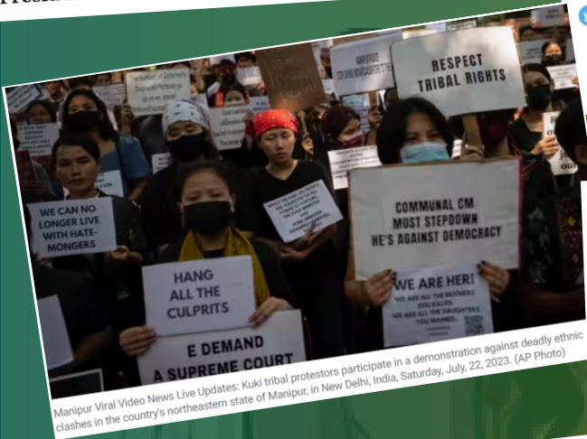
Manipur Viral Video News Live Updates: Kuki tribal protestors participate in a demonstration against deadly ethnic clashes in the country's northeastern state of Manipur, in New Delhi, India, Saturday, July, 22, 2023.